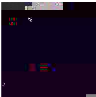
Left: Sketch of 1860 total solar eclipse showing a coronal mass ejection. Image: G. Temple/NASA.