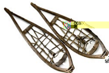
Chukchi-Style Snowshoes, Sib8, ..no...