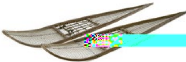
Iñupiaq Snowshoes ( tagluk ), 1887. National Museum of Natural History, E127941